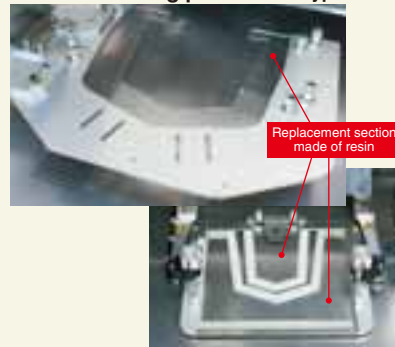
Pocket presser plate